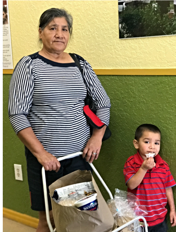
On the left: Some of our volunteers taking care of the registration table. On the right: A grandmother came to pick up her bag during our food pantry.