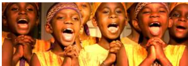
Young Voices of Africa Evening Concert