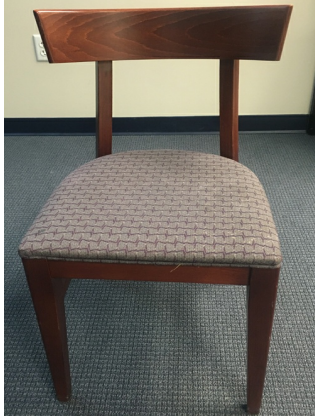
WOOD BACK "SORT OF" MATCHES TABLE

The above furniture is located at Palma Ceia Presbyterian Church. If interested, please contact Wally Wilcher at wally@palmaceia.org .